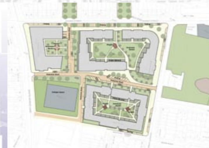
continuous open space - greens, streetscape, shared gardens, homezones, squares and parks