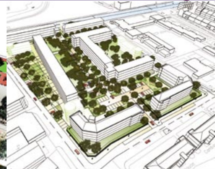
reorganising space - parking and vehicular access make way for homezones and play areas