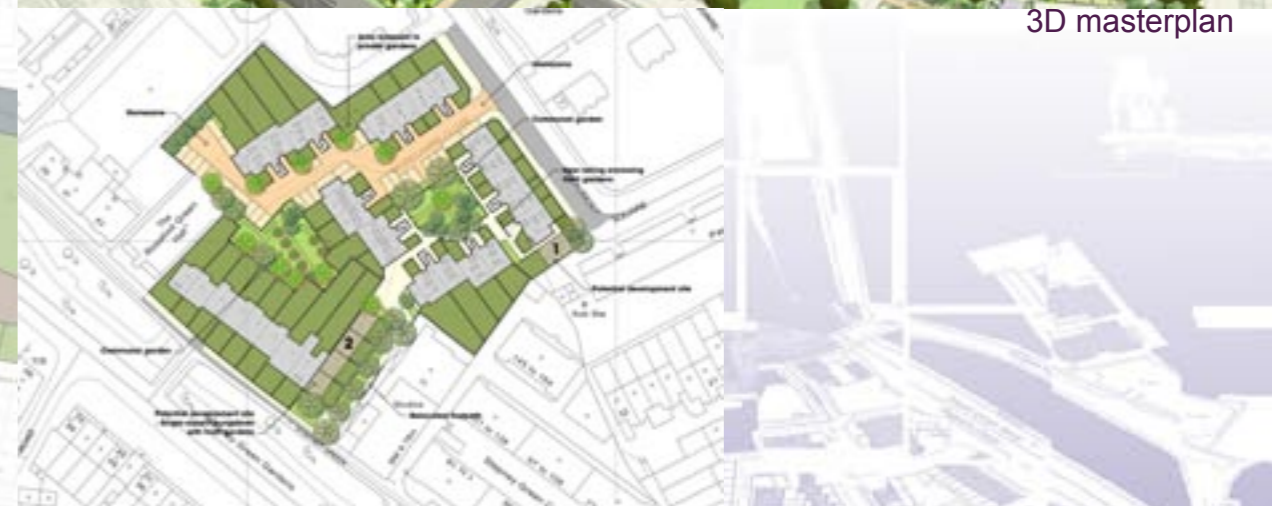
introducing homezones and shared gardens