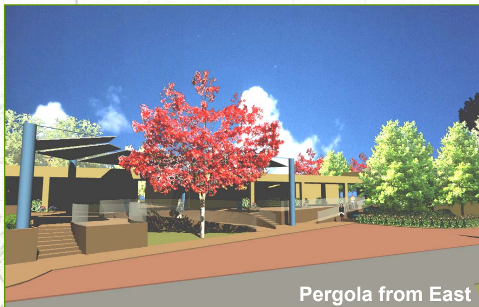
Pergola from East