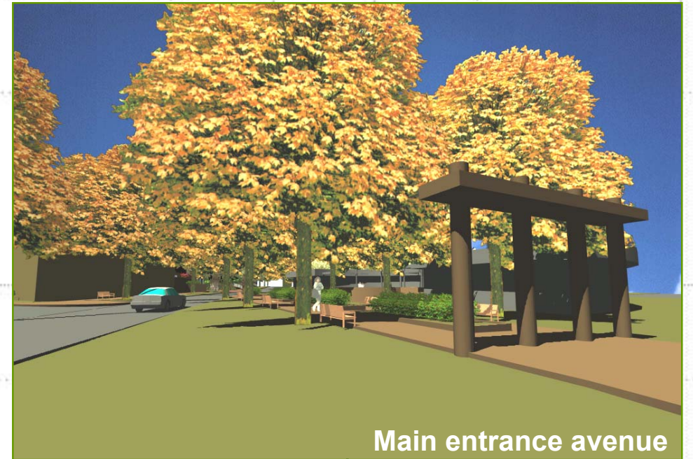
Main entrance avenue