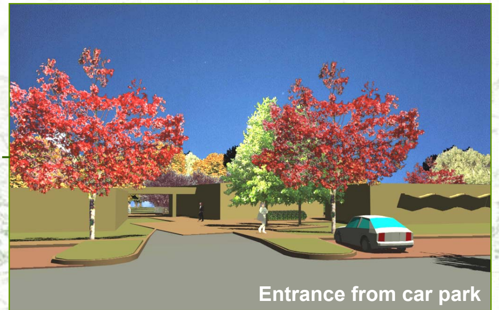
Entrance from car park