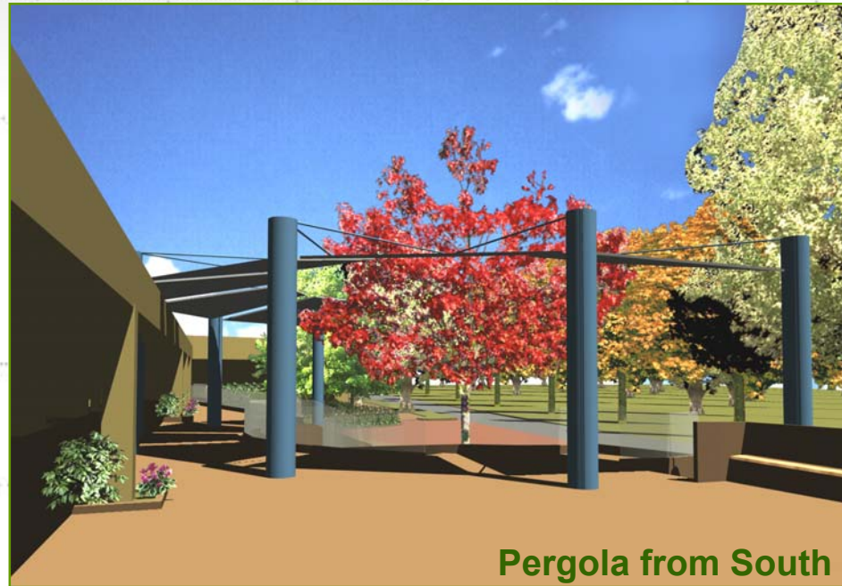
Pergola from South