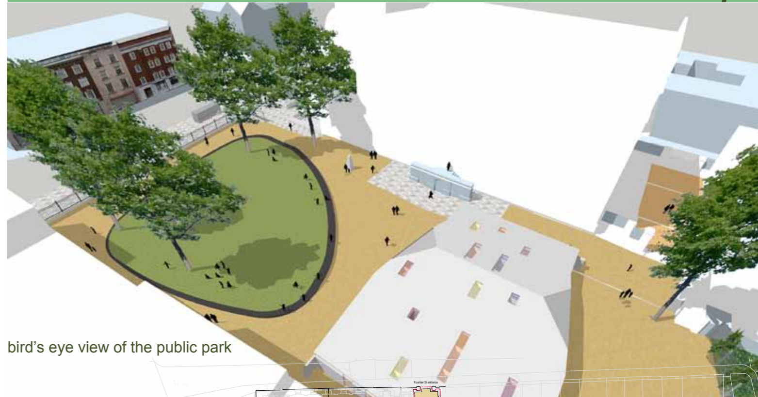
bird's eye view of the public park

The design for the enlarged public park establishes a new axis along the church, a new plaza and the new school entrance. The design for the school playgrounds offers multiple adventure trails and optimises the limited space available.