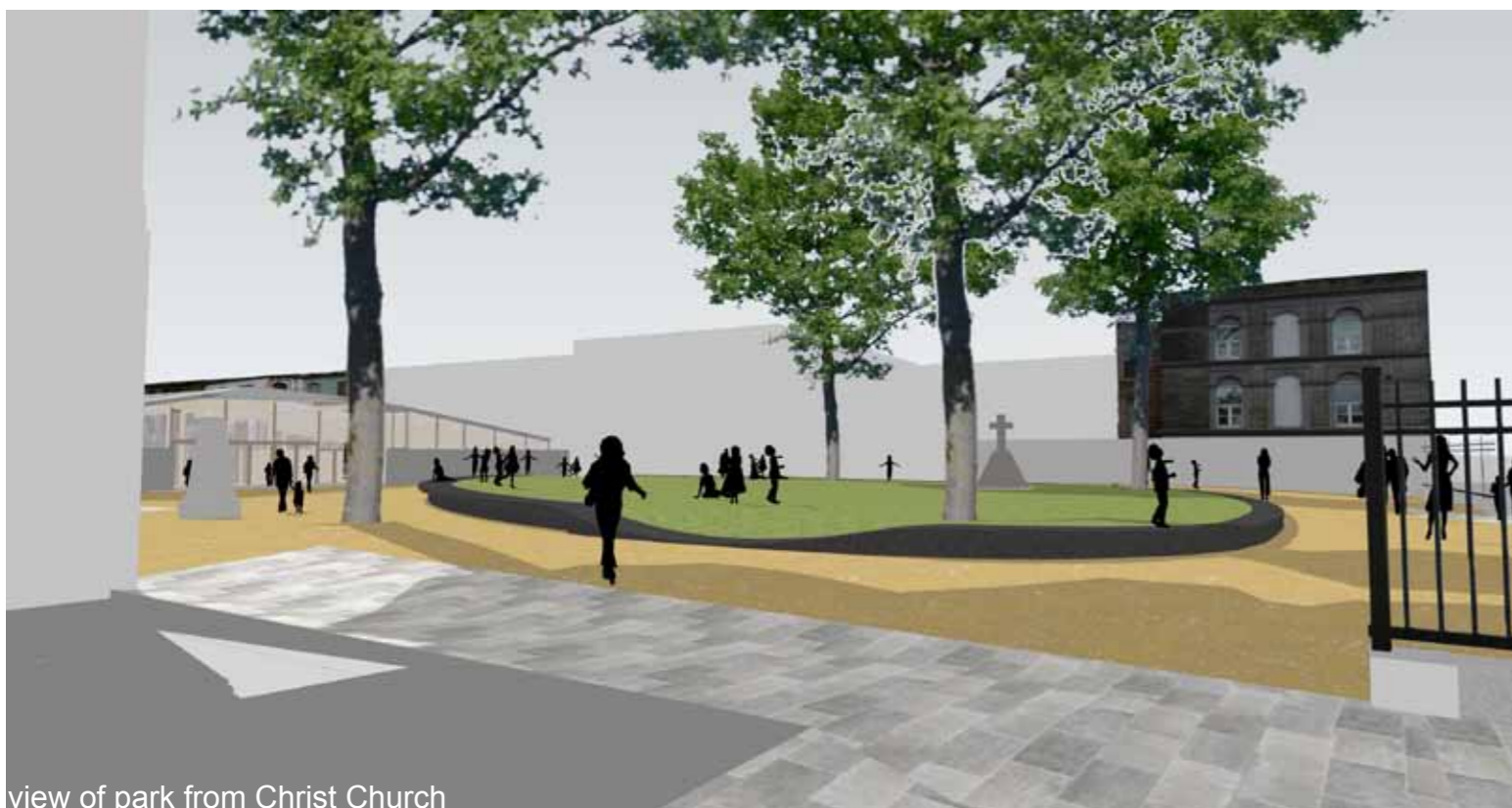
view of park from Christ Church